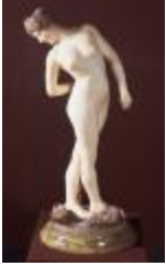
Joueuse de boules (200251)