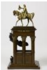
Bonaparte entrant au Caire (200494)