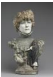
Sarah Bernhardt (15297)