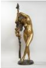
Bacchante au thyrses accompagnée d'un amour (201076)